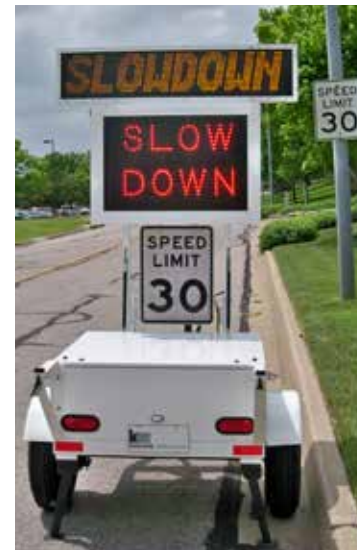
SMART 850 with variable message sign